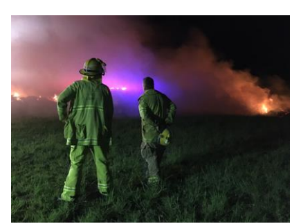
Hazard Reduction burning at Memorial parklands Taroombal.