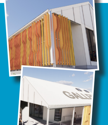
Fig Tree Galleries

Current expansion works of the Fig Tree Galleries (formerly the Mill Gallery) are progressing well, as construction begins on the new gallery building. In association with the recent refurbishments to the Old Post Office building, the completion of the new gallery will create vibrant new spaces for artists and visitors to enjoy.