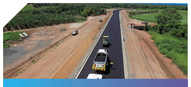
Panorama Drive $30 M +