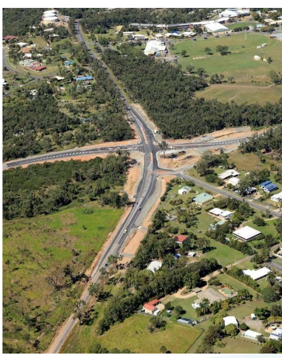
Strategic Infrastructure: Panorama Drive

STRATEGIC FRAMEWORK STATE-WIDE CODES OVERLAY CODES LOCAL PLAN CODES ZONE CODES USE CODES AND OTHER DEVELOPMENT CODES