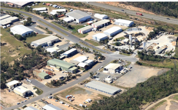
Figure 4: Medium impact industry (Jabiru/Plover Drive) area

Disclaimer: The content of this information sheet is a summary and has been prepared to assist the reader to understand the Planning Scheme. This advice given does not bind or fetter the Council in any way in exercising its statutory responsibilities in assessing any development application which might be made to the Council. Please refer to the full Livingstone Planning Scheme 2018 document on Council's website for further detail.