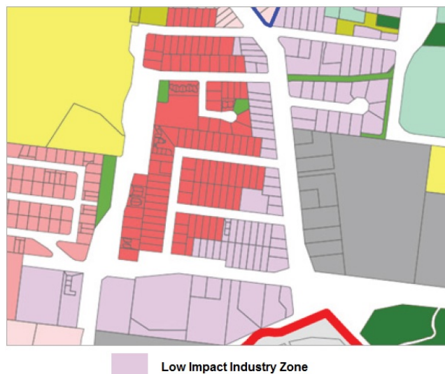
Figure 1: Example Map - Low impact industry zone

Reference should be made to the definitions contained in Schedule 1 of the planning scheme.