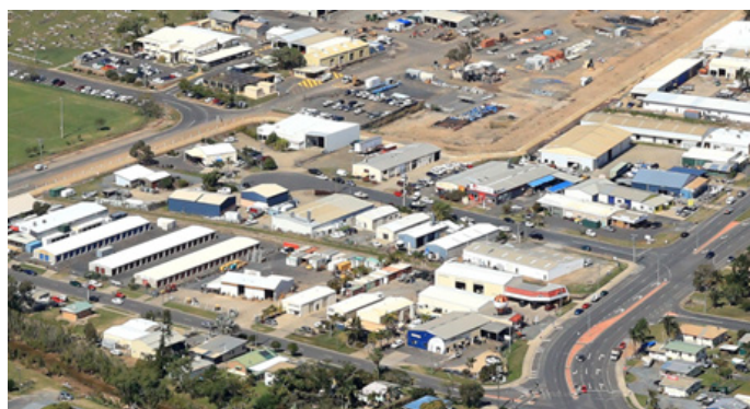
Figure 2: Low impact industrial area